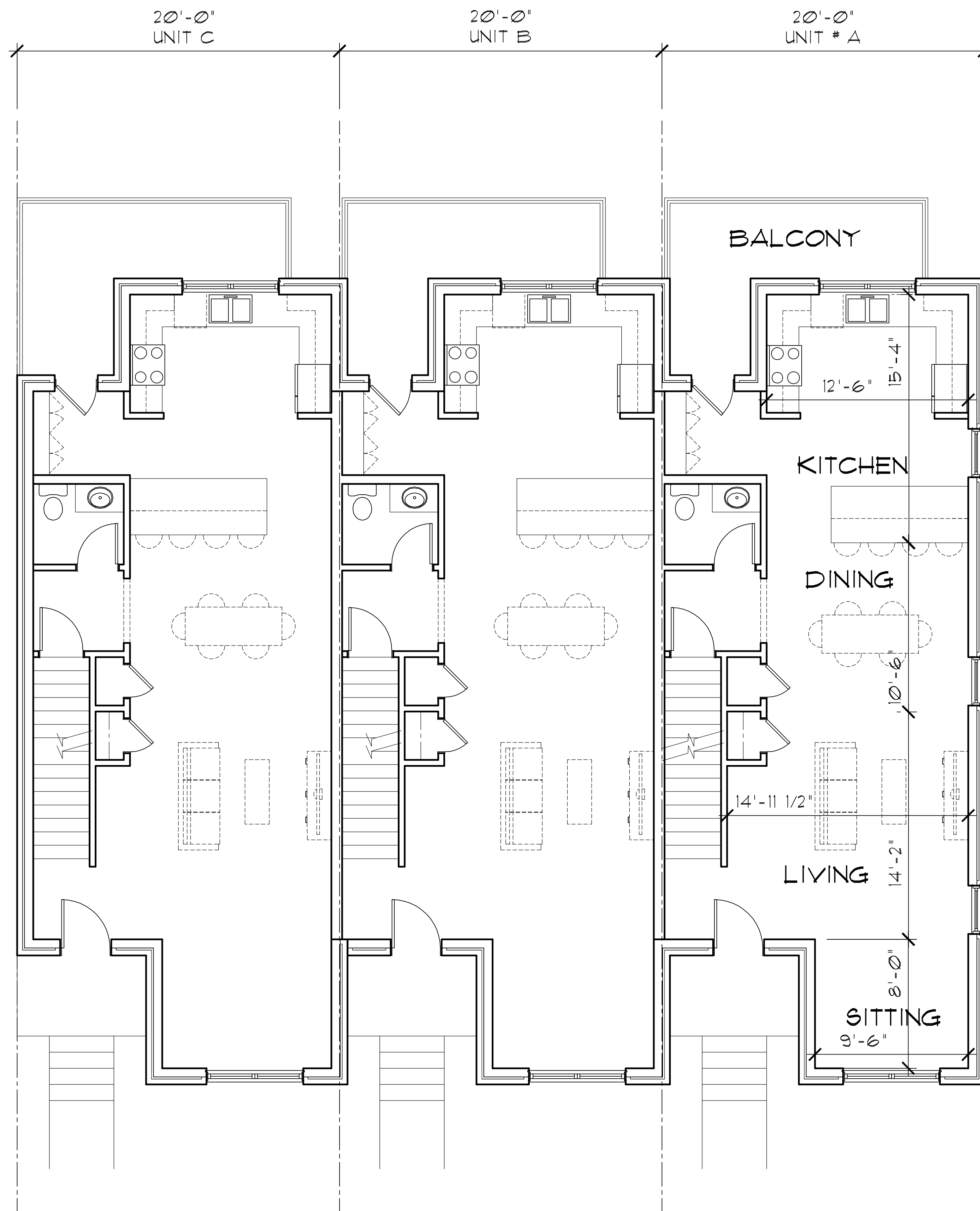
SCHEME 'A' FIRST FLOOR PLAN Scale: 1/4" = 1'-0"