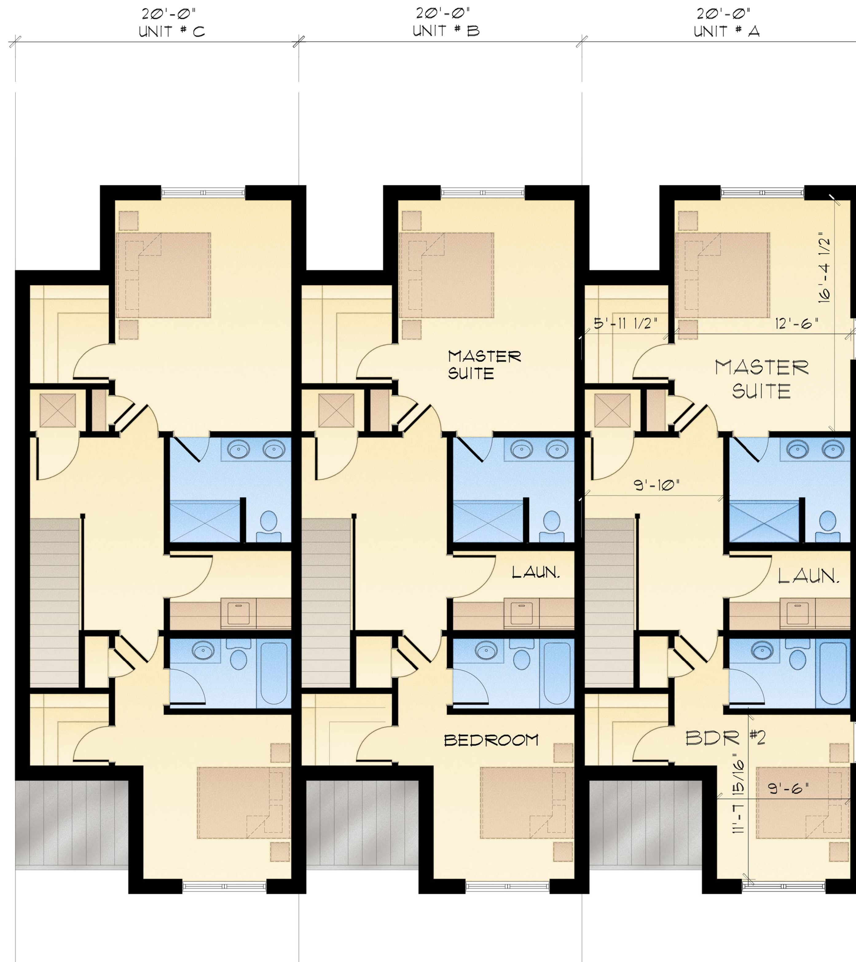
SCHEME "A" SECOND FLOOR PLAN Scale: 1/4" = 1'-0"